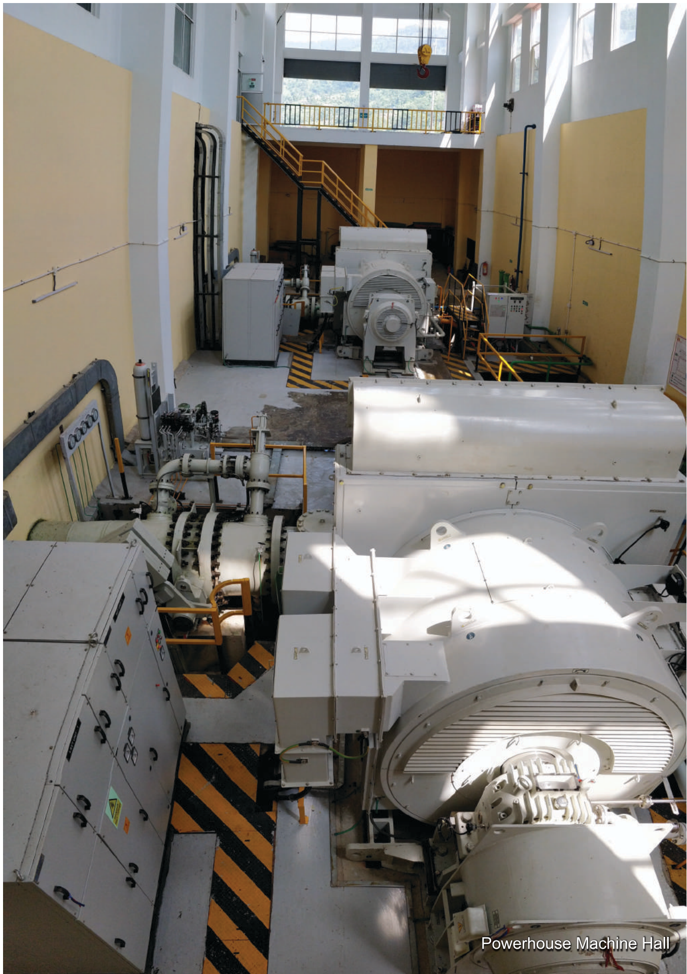
Powerhouse Machine Hall