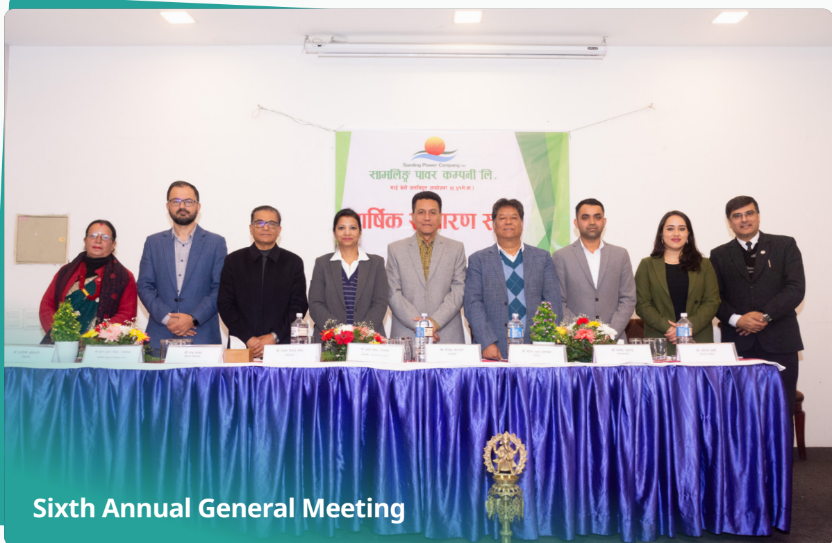
Sixth Annual General Meeting