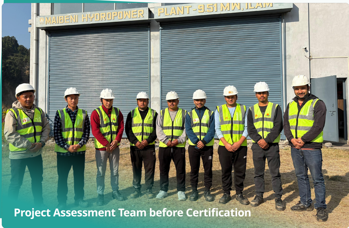
Project Assessment Team before Certification